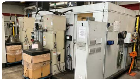
2 Panasonic YA-1 Welding robots (2015)