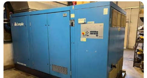
Gardner Denver L200RS-7.5A Screw air compressor (2011)

All assets are being sold strictly "as is, where is". No warranty is given, expressed or implied as to the condition or its fitness for use. Although the information contained herein was obtained from sources deemed reliable, the seller and Troostwijk make no warranty, expressed or implied as to the accuracy of the information. This brochure does not constitute a formal offer of sale. Details in this brochure are expressly excluded from any sale contract and assets may be subject to prior sale. All assets will be sold in accordance with Troostwijk's standard and specific terms and conditions of sale; further information is available on request.