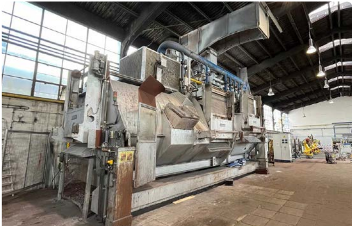
2010 Balzer WGK 4000/10000 smeltoven

DGH manufactures aluminium sand casting parts used in the automotive industry as well as energy and heating technology i.e. lightweight parts and components for chassis and drive trains, both for combustion engines and electric vehicles as well as heat exchangers.