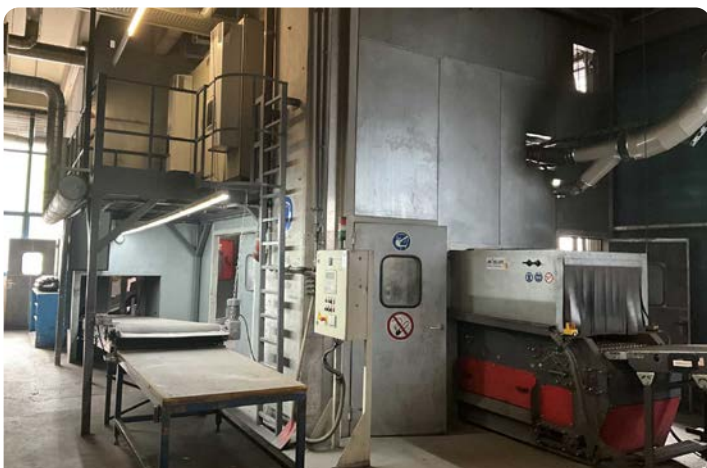
Rösler RDGE 800-4 continuous flow Shotblasting system (2004)