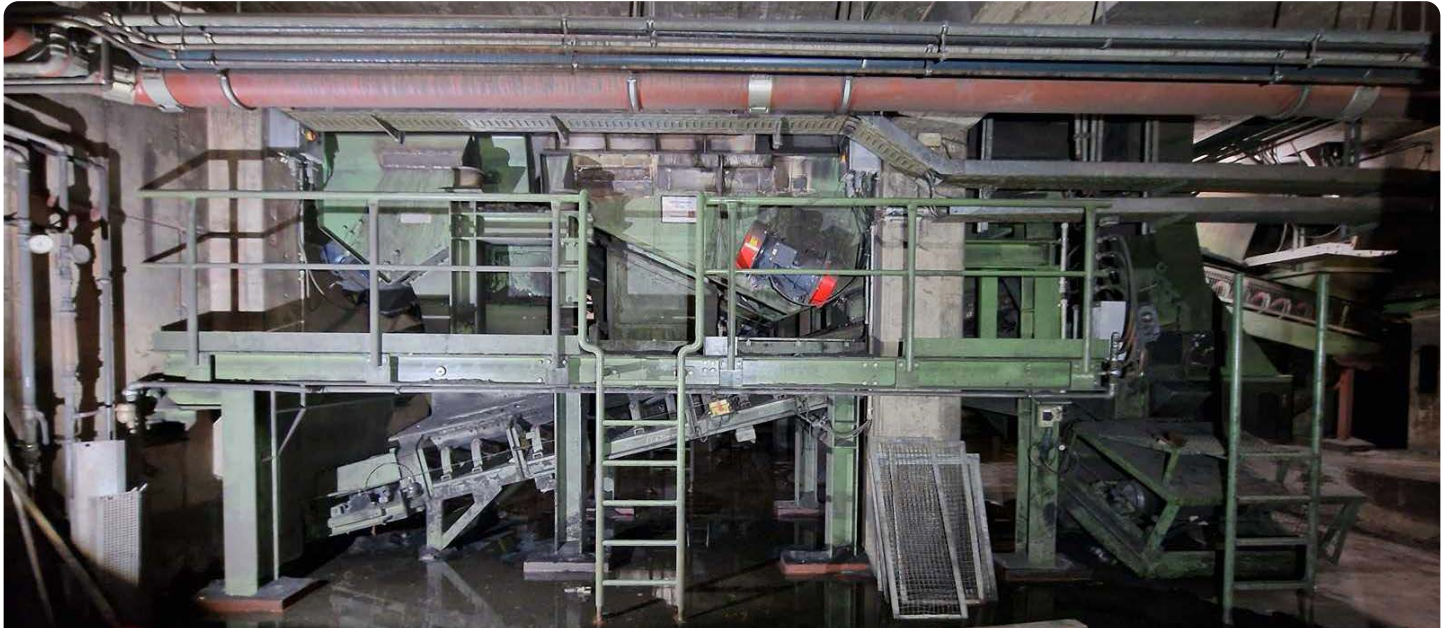
Georg Fischer Complete automatic sand processing plant