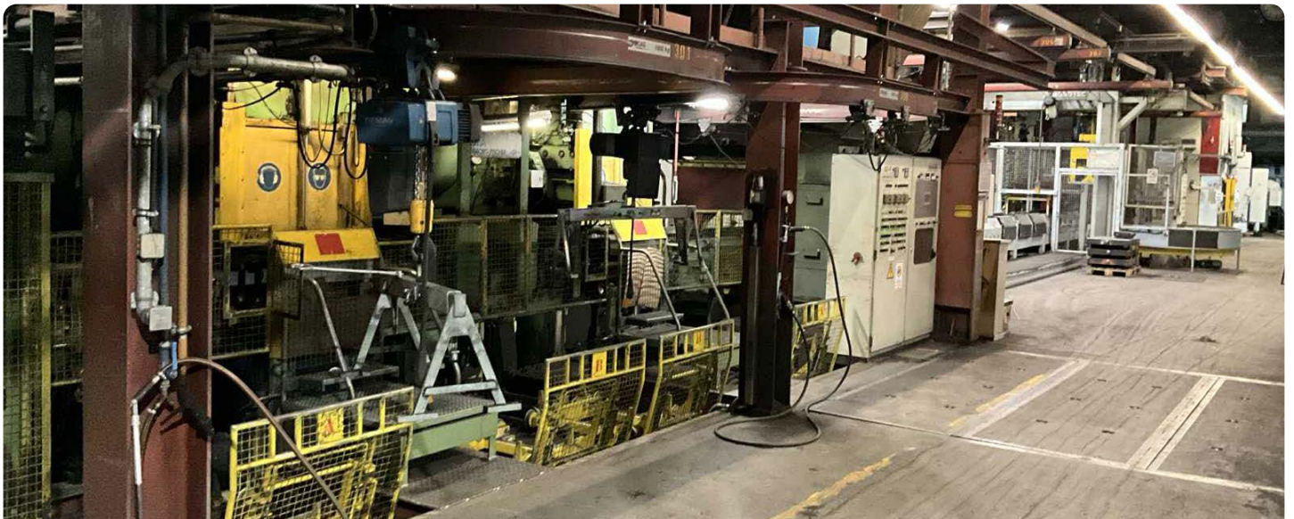
CNC controlled MOULDING LINE “Georg Fisher” Impact Standard IM-S1 (1988 – 2015) consisting of 1 forming machines, cap. 180 forms/h, each 20 seconds, mould dim. 900 x 700 x 300/300 mm.