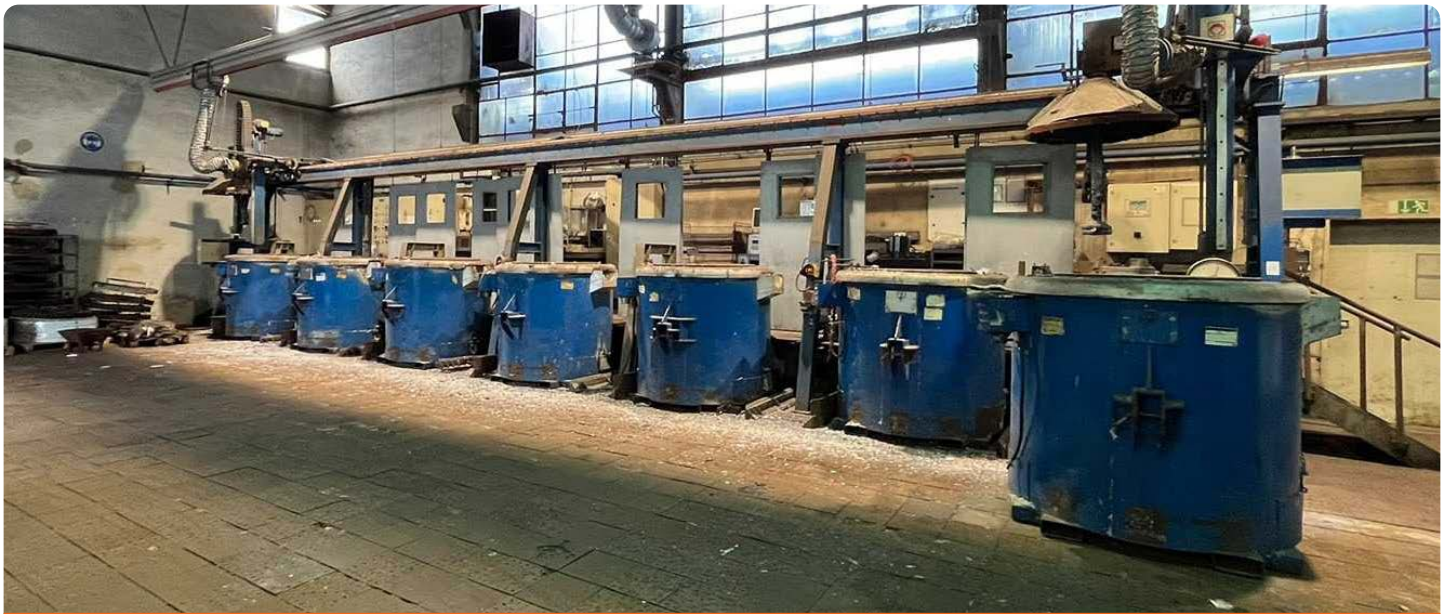
Balzer TTE HF 800 SPEZ aluminium mixing and testing station