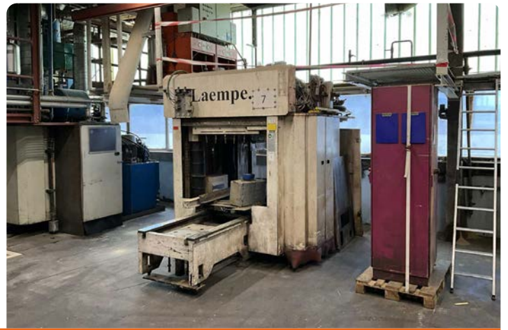
4 x Laempe LFB50-65H-Lora (2011), LB25 (2005), LFB25 (2000) and L20 Core shooting systems Shotblasting system (2004)