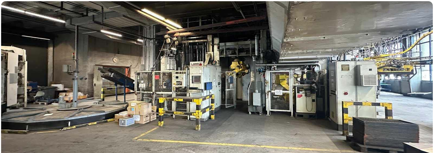
Janke Robotized DE-CORING SYSTEM (2000 – 2006)