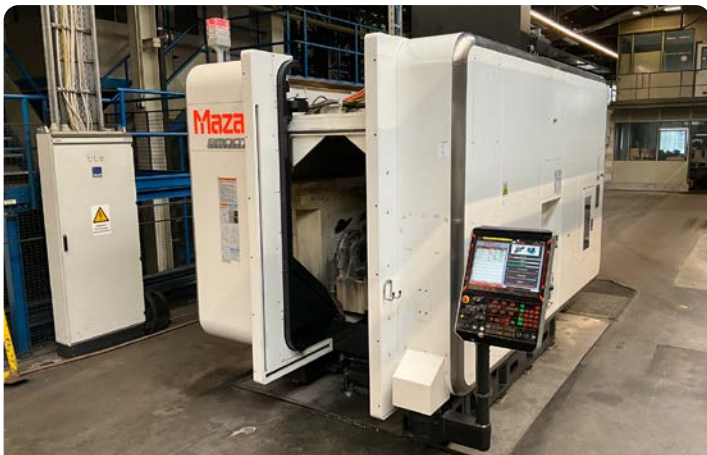
2017 Mazak – VARIAXIS i-700 CNC