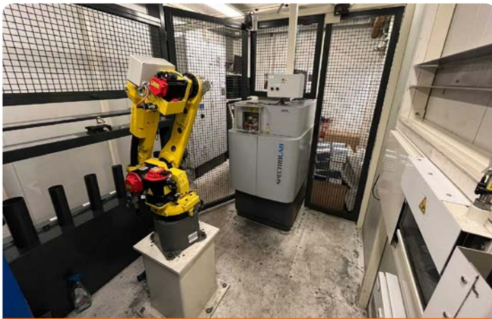
Spectro Lab LAVM11 (2013) fully automatic spectro analysis system