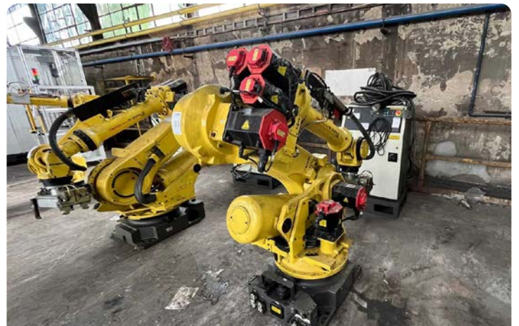
+/- 20 Fanuc R-2000iB/165F Handling robots (2000 -2016)