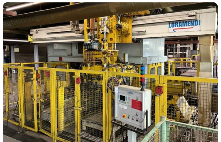
Loramendi SLC2 60L CF Core shooting system (1999)