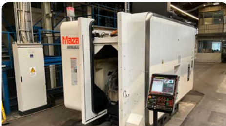
Mazak VARIAXIS i-700 CNC Machining Center (2017)